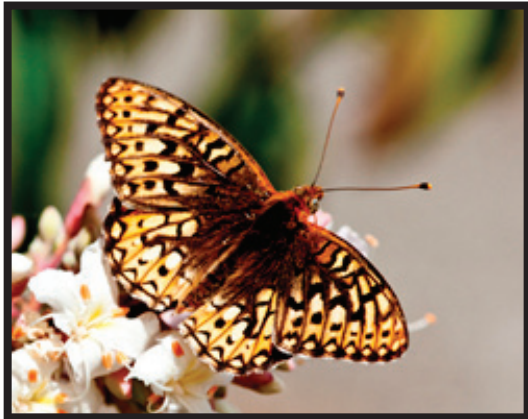
Callippe: File No 3518-213-133-U88S