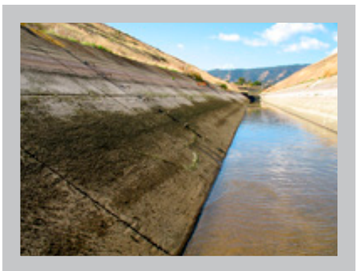
Putah South Canal - mussel survey section

Base of Monticello Dam (Putah Creek side) is examined quarterly, plankton is collected monthly, colonization plates examined monthly.