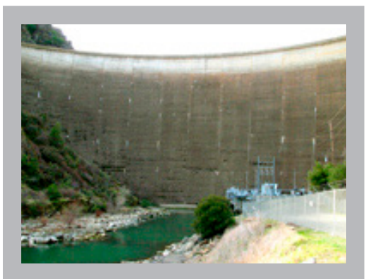
Monticello Dam / Putah Creek survey area