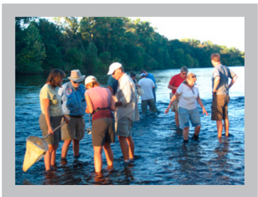
Angler education - American River

Certain areas of the thirty-mile long canal are examined monthly during routine surveys for New Zealand Mudsnails, Dreissena mussels and other invasive species.