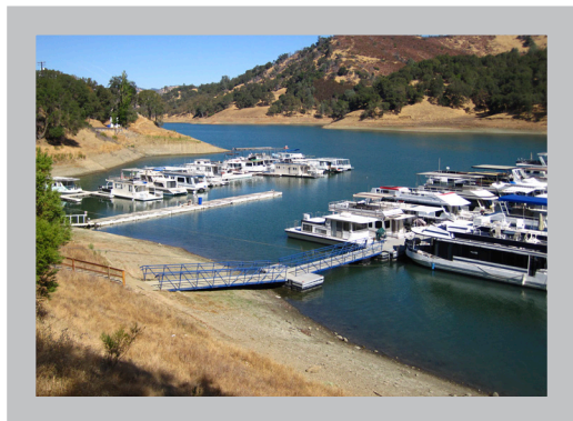
Pleasure Cove boat docks