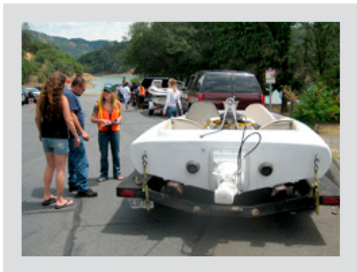
Boat Inspections at Capell Launch Ramp