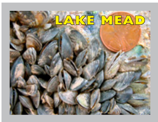
Close-up: Quagga mussels on Lake Mead Survey Boat.

Boat Inspections by USBR - Berryessa Staff at Capell Cove after Watercraft Inspection Training. I am certified by Pacific States Marine Fisheries Commission to train Watercraft Inspectors.