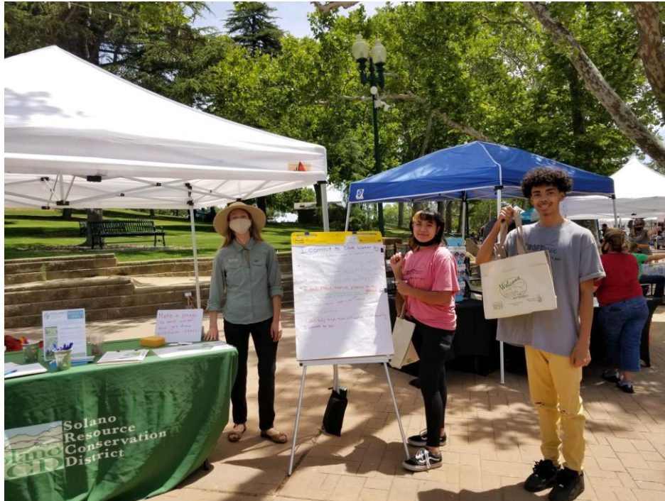
Vacaville Farmers Market, May 2021

4. Volunteer events: Solano RCD manages several large restoration programs throughout the County, and often solicits volunteers from the community to assist with propagation, planting, irrigation, weeding, etc. at restoration sites and the Conservation Education Center. Volunteers often receive Welcome to the Watershed kits in addition to learning about native plantings and practices.