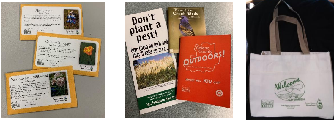
Examples of some items found in a Welcome to the Watershed kit, including native seed packets and literature.

Typically, these items are distributed to landowners in a re-usable canvas shopping bag (below).