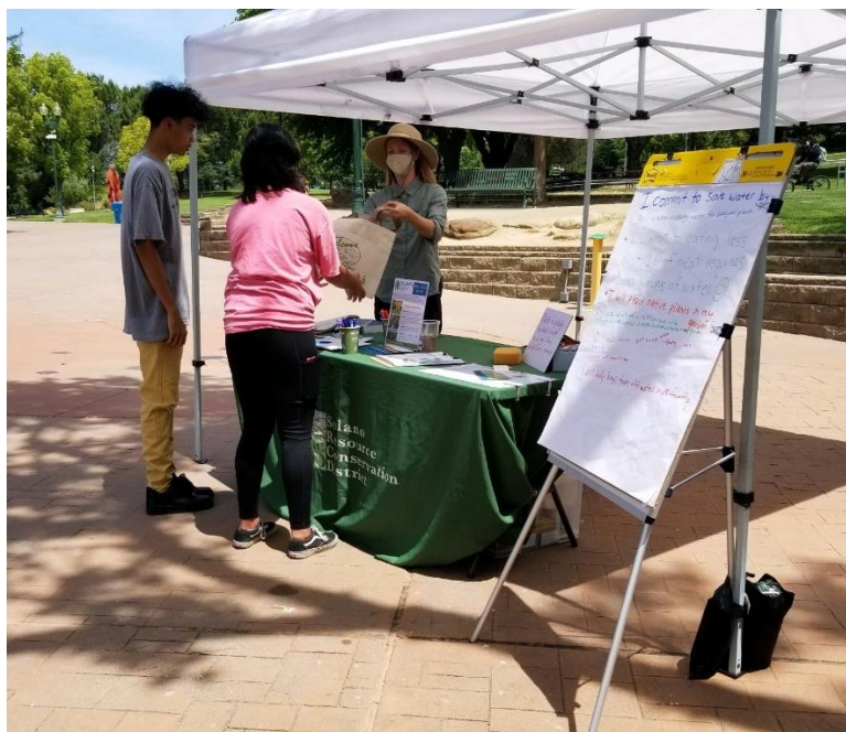
Vacaville Farmers Market, May 2021

This year most tabling activities were suspended due to Covid-19. Most of the events Solano RCD tables at were cancelled. Fortunately, the Vacaville Farmers Market began again this spring and Solano RCD was able to table the entire months of May and June to offer information on Welcome to the Watershed and the current efforts underway in the Solano Subbasin regarding SGMA and groundwater.