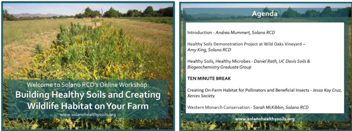
Slides from a Healthy Soils workshop facilitated by Solano RCD virtually, January 2021

3. Tabling at eco-events: Solano RCD staff participate in local environmental events and agricultural festivals several times per year to promote the Welcome to the Watershed program and distribute the kits. Our staff educate visitors about water conservation and water quality protection. We tailor the displays to the audience. Displays include brochures about native plants; displays of pollinator insects; a hands-on display that highlights the problems seabirds and other animals face when feeding in waters degraded by plastic pollution; and a 3-D watershed model that demonstrates how run off moves from uplands to waterways.