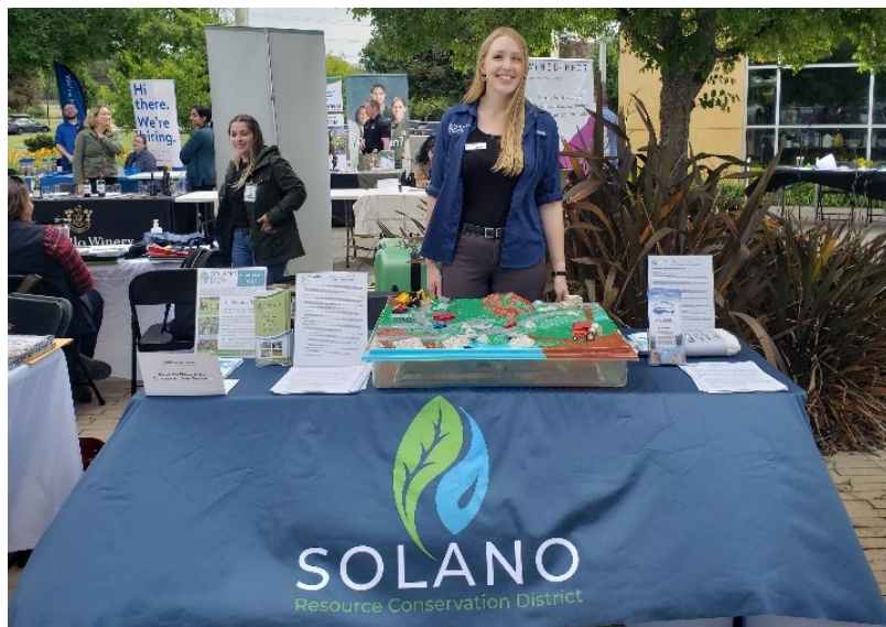
STEAM Discovery Festival in Benicia, May 2022

3. Tabling and Outreach: Solano RCD staff participate in local environmental events and agricultural festivals several times per year to promote the Welcome to the Watershed program and distribute the kits. Our staff educate visitors about water conservation and water quality protection. We tailor the displays to the audience. Displays include brochures about native plants; displays of pollinator insects; a hands-on display that highlights the problems seabirds and other animals face when feeding in waters degraded by plastic pollution; and a 3-D watershed model that demonstrates how run off moves from uplands to waterways; and a variety of handouts and pamphlets.