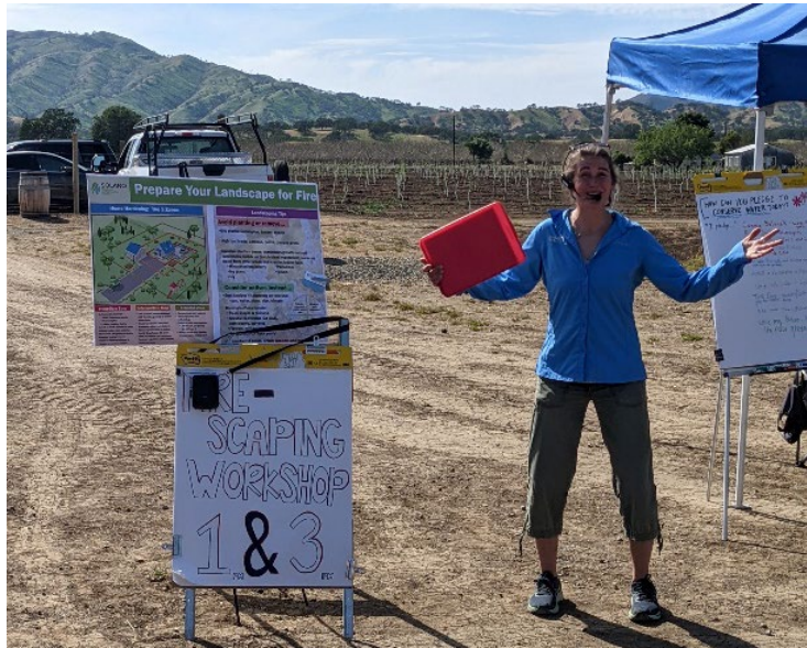
Firescaping workshop at the Spring Plant Sale in Winters, March 2022

In addition to any workshop-specific handouts and materials, workshop participants are offered Welcome to the Watershed kits.