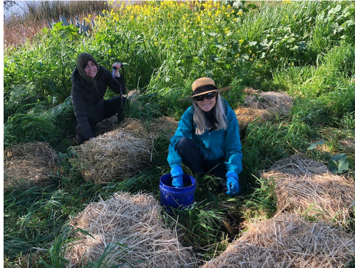
Volunteers at Glen Cove in Vallejo, February 2022

Unfortunately, due to Covid-19, we only hosted 3 volunteer planting events this year, well below our normal number of volunteer days.